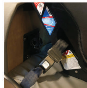
RUN LAP BELT THROUGH BACK OF CAR SEAT AND SECURE. TIGHTEN AS NEEDED.