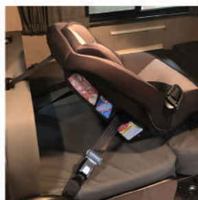
WHEN CHILD SEAT IS BEING INSTALLED. TETHER AND LAPBELT ATTACHED (BUT NOT CINCHED)