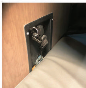
TOP TETHER ATTACHED TO LOWER TETHER