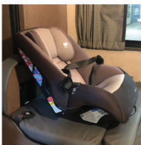
LOWER DINETTE AND PLACE CHILD SEAT ON DINETTE BENCH FACING FORWARD